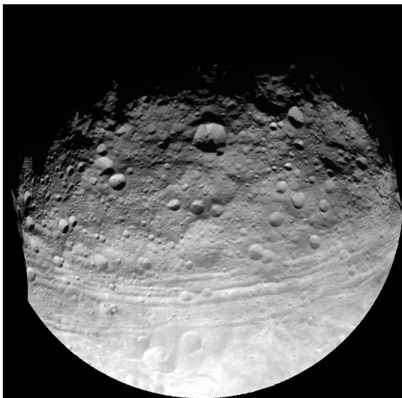
This full view of the giant asteroid Vesta was taken by NASA's Dawn spacecraft, as part of a rotation characterization sequence on July 24, 2011, at a distance of 5,200 kilometers (3,200 miles).

This article was provided courtesy of the Jet Propulsion Laboratory, California Institute of Technology, under a contract with the National Aeronautics and Space Administration.